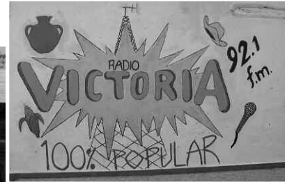
Inside the Radio Victoria studio. Mural on the wall of the building.

The purpose of the project is to build transnational communication structures on a grassroots level, to raise awareness about our communities common struggles for peace, justice and democracy, and to provide mutual aid and technical training. Projects will include: news story exchanges between WORT's "En Nuestro Patio" and Radio Victoria, simulcast music programs with "Rock en Español," technical assistance, and training exchanges.